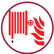
Fire Suppression and Fighting