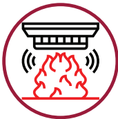
Very Early Smoke Detection