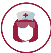
Nurse Call Systems