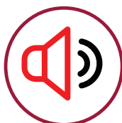
Public Address Voice Alarm