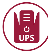
Uninterruptible Power Supply

Life Safety Solutions for every installation